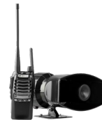
Too Loud (Megaphone)